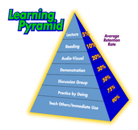
Figure 1 Learning pyramid after Bales (1996)

More specifically for GI distance learning, the added value of collaborative learning lies in the fact that the UNIGIS student body is many-sided. Students have different disciplinary backgrounds, work in a broad range of organisations in different functions and even in different countries. So approaching a common assignment from these different angles, a technical GI student can for instance work together with a GI managerial student, thereby broadening their views.